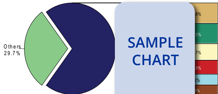
NORTH AMERICAN RAW SAND PROPPANT MARKET SHARE, 2014 ($3.2 billion)